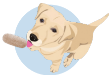
Administer the tablet directly