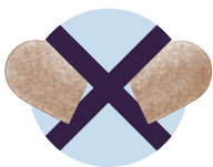
Don't break tablets open

The number of tablets administered may be gradually reduced, or increased, at any time at the recommendation of your veterinary surgeon.