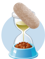
Tablet(s) 1 hour before food